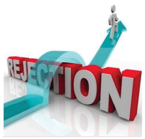
The answer to these

rejected, we make excuses and create justifications for our failures and try to hide behind them. But onemust question, this hesitation to confront rejection? Why do we feel uncomfortable thinking about rejections? Why is rejection perceived as negative?